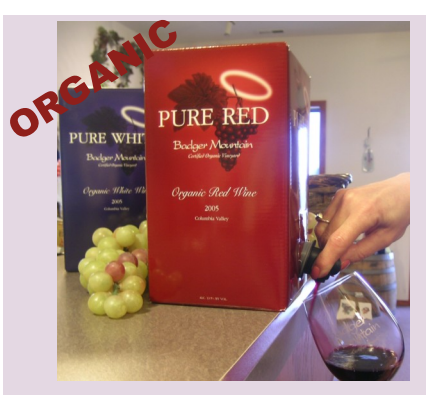
Badger Mtn Pure Red/Pure White

The only organic 3L box wine! Pure White is crisp, fruity & dry, Pure Red is soft and luscious. Both organic - no sulfites added. Stays fresh for weeks after opening.